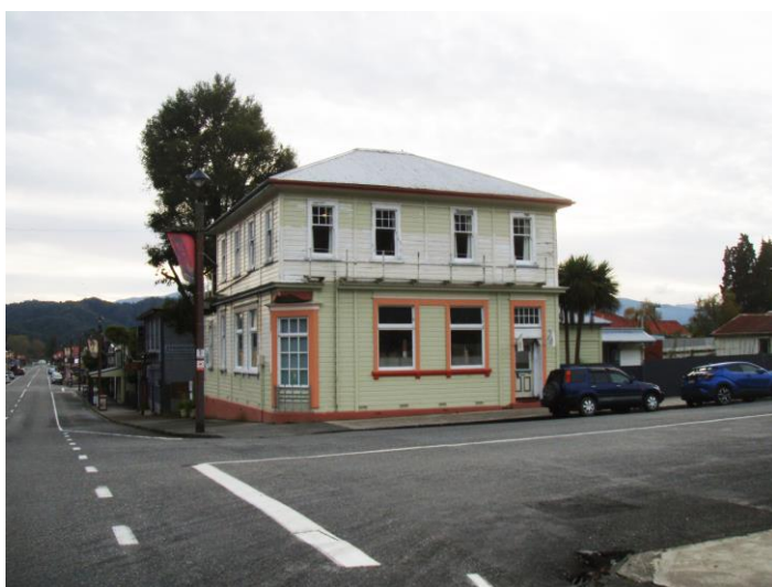
Former Bank of New Zealand building