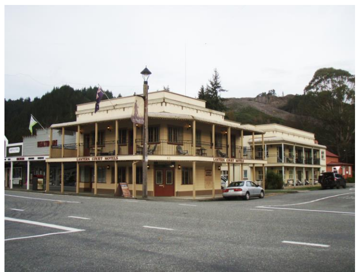
Lanterns Court Motel