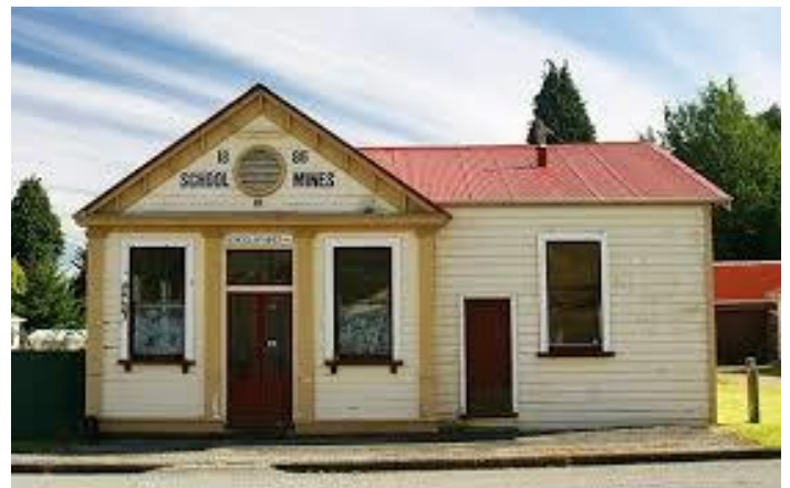
School of Mines