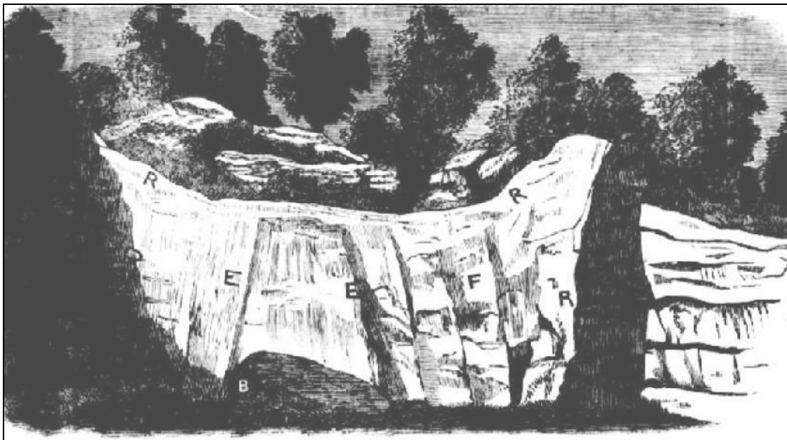
Figure 2: View (looking east) showing Dargue's Reef exposed by surface workings in January 1870. The letters R define the edges of 'reef', which is 15 foot (4.6 m) wide.