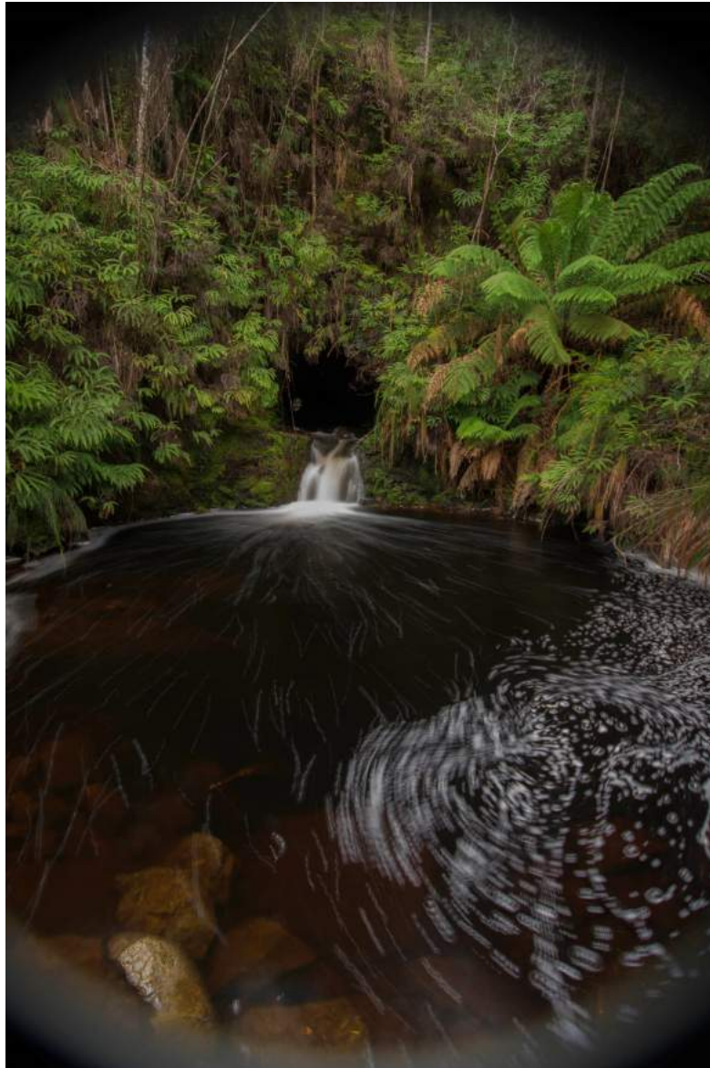
Figure 5: Diversion tunnel at Mayne's tin mine Heemskirk tin field

Former Peripatetic Tin Mine manager Con Curtain estimated that at least £100,000 were spent at Heemskirk 1880–84 for a return of about 70 to 100 tons of dressed tin. 63 By 1962 total production on the field had not progressed substantially, amounting to about 668 tons of metallic tin. 64 The Federation Mine, which incorporated the old West Cumberland, Cumberland and East Cumberland workings, produced about 194 tons of metallic tin in the years up to 1916 and 1927–53. 65 Mayne's Tin Mine (see Fig. 5), situated near where the Orient Mine conducted its disastrous crushing in 1883, accounted for a further 140 tons of metallic tin in the years up to 1916. 66 Perhaps the Orient should have been the premier mine on the field after all.