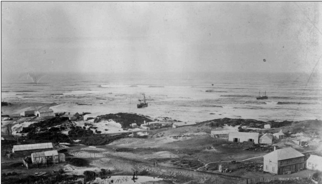
Figure 4: Trial Harbour, port for the Heemskirk tin field, c1890, with the hotel at right.

Heemskirk, just as at Bischoff, the Cornish miners probably regarded each other as rivals and competitors for work. 57