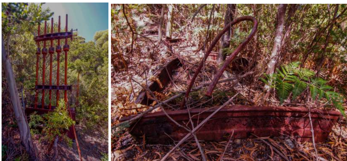
Figures 2 and 3: The stamper battery and part of the waterwheel at the Carn Brea tin mine.

pitched his camp in a snug corner formed by the junction of two banks above a small creek. He has not wasted the shareholders’ money by erecting large and substantial houses, stable and blacksmith’s shops, with a store and a post office thrown into the bargain, but has contented himself with putting up tents, and cutting chimneys and fireplaces in the bank. 35