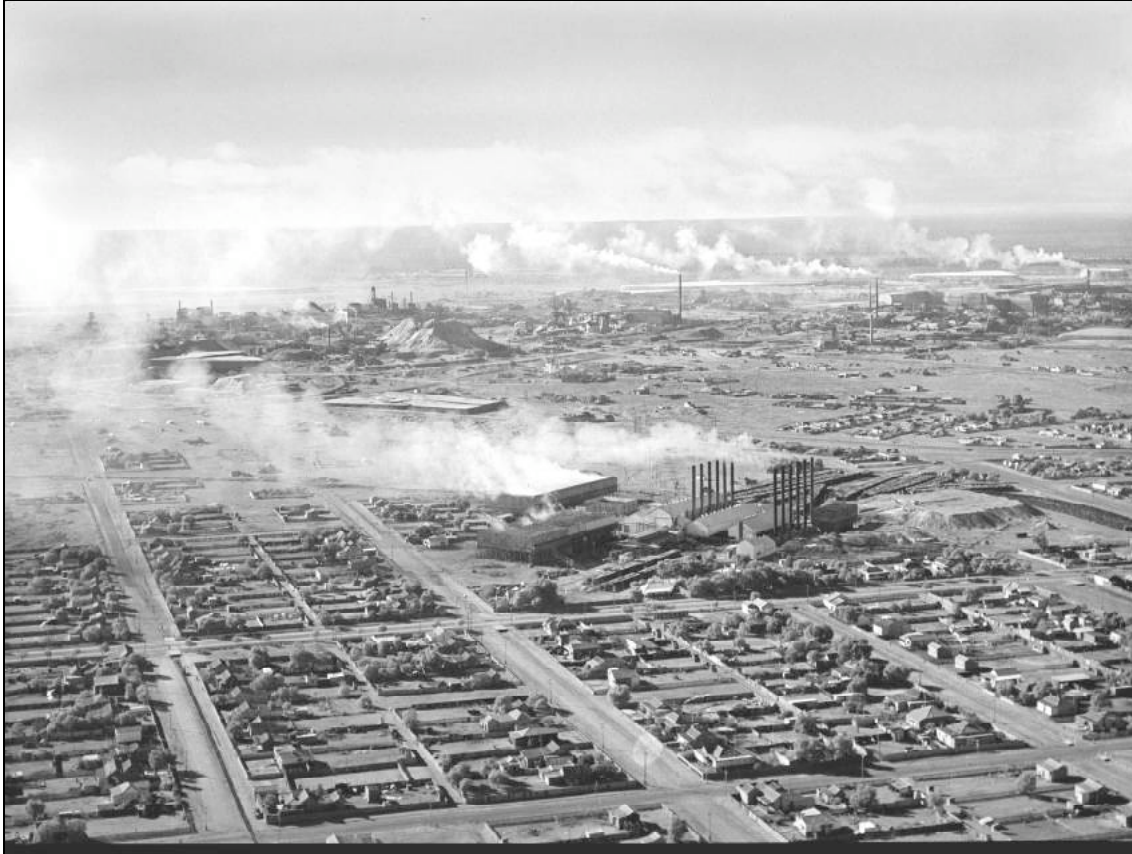
Figure 3: Mining and Ore Treatment, Boulder/Kalgoorlie -1930s [illustrating pollution]