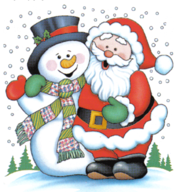
Christmas joy warms the heart

A belated Merry Christmas and a Happy New Year to all our members.