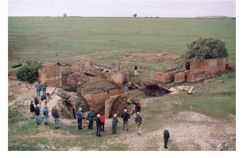
Brick magazine, Loddon Valley Goldfields Mine, near Carisbrook

Elevated view of AMHA group around a shaft, Stewart's Freehold Mine, near Carisbrook