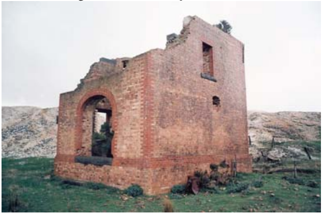
Engine house, Duke of Cornwall Mine , Fryerstown

Brick Cornish engine house, Berry No.1 Shaft, near Smeaton