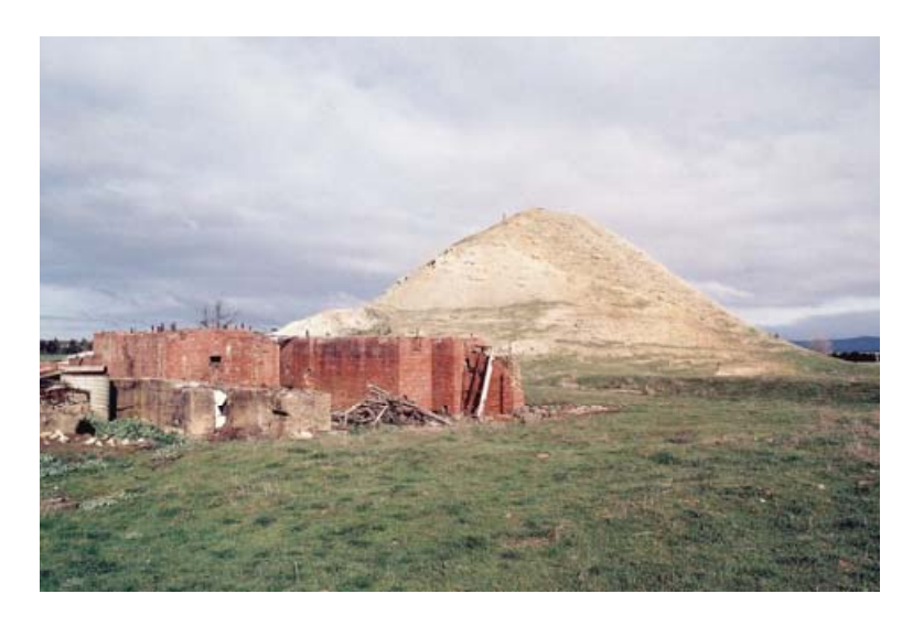
Shaft water baler, Dyke's North West Shaft, near Smeaton

Machinery site & dump in the background, Berry United Mine, near Smeaton