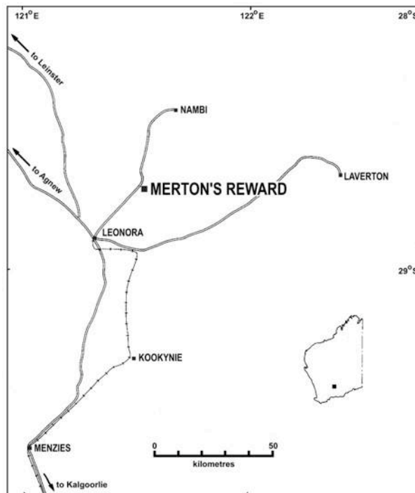
Figure 1: Location map for Merton's Reward Gold Mine