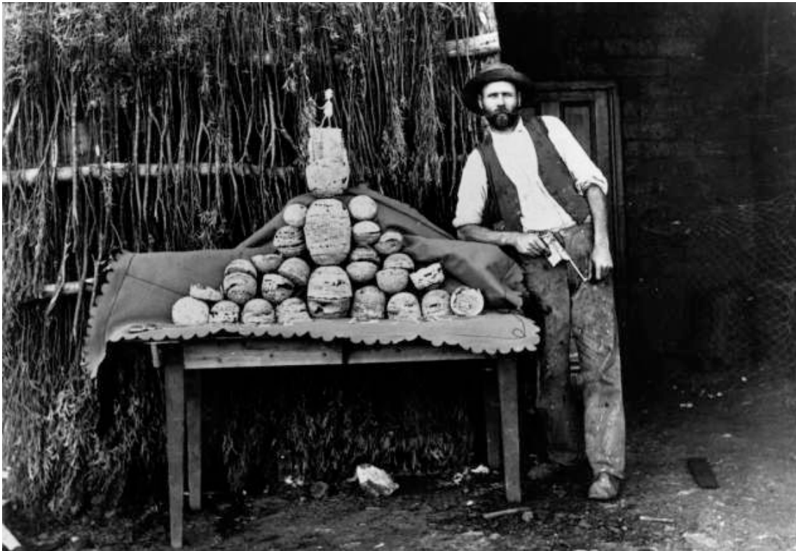
Figure 4: Merton’s Reward – the owner and his gold