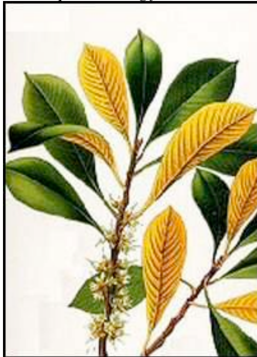
Figure: 1: Palaquium Oblongifolia or Isonandra Gutta

Source: William Rhind, A History of The Vegetable Kingdom , Blackie & Son, London, 1855.