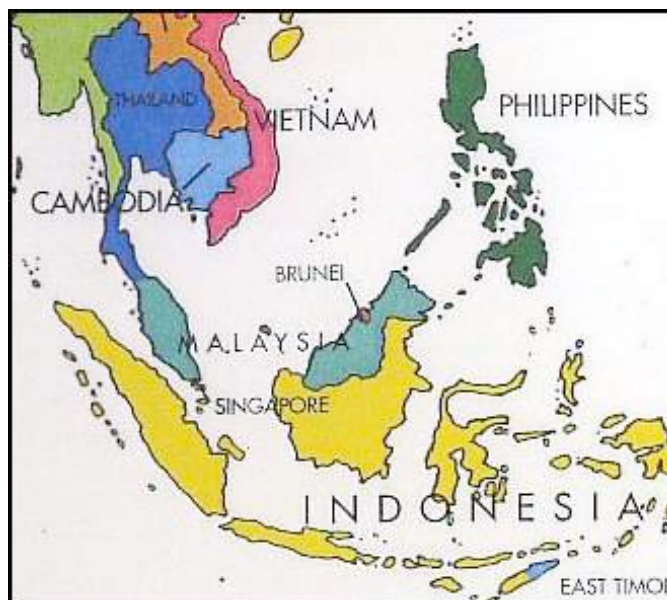
Figures: 2a & 2b: Maps showing areas of distribution of commercial gutta

Borneo, the Phillipines and in Suriname, French Guiana and Guyana (Fig. 2). However, the sap collected from Central and South America is of a somewhat inferior quality compared with that from the East. After collection, the raw gutta percha was almost all channelled through Singapore by Chinese traders who had the monopoly of its early trade. 8