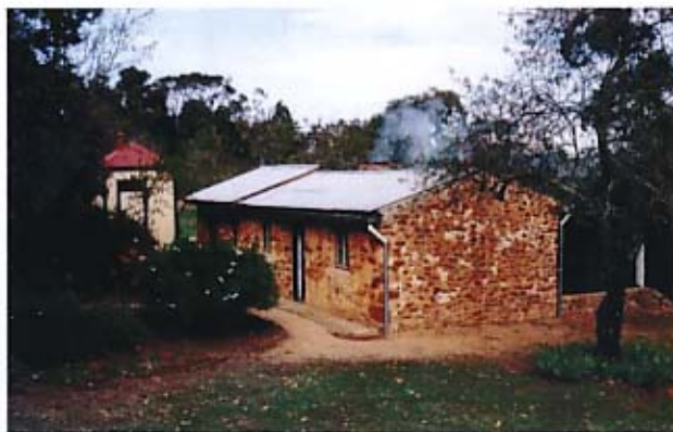
Bowden's Cottage as it stands today